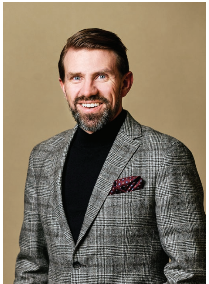
Paul Stormoen CEO of OX2

The way we act determines who we are and how we are perceived. We are resolved to act with professionalism and integrity in everything we do. Our Code of Conduct is part of OX2's foundation and how we operate. It represents what we stand for and functions as a roadmap for doing business the right way and guides us in our everyday work. Conducting business ethically, with integrity and transparency, is vital and I expect everyone working within OX2 to follow and comply with this Code of Conduct and I want all of our stakeholders to know about it.